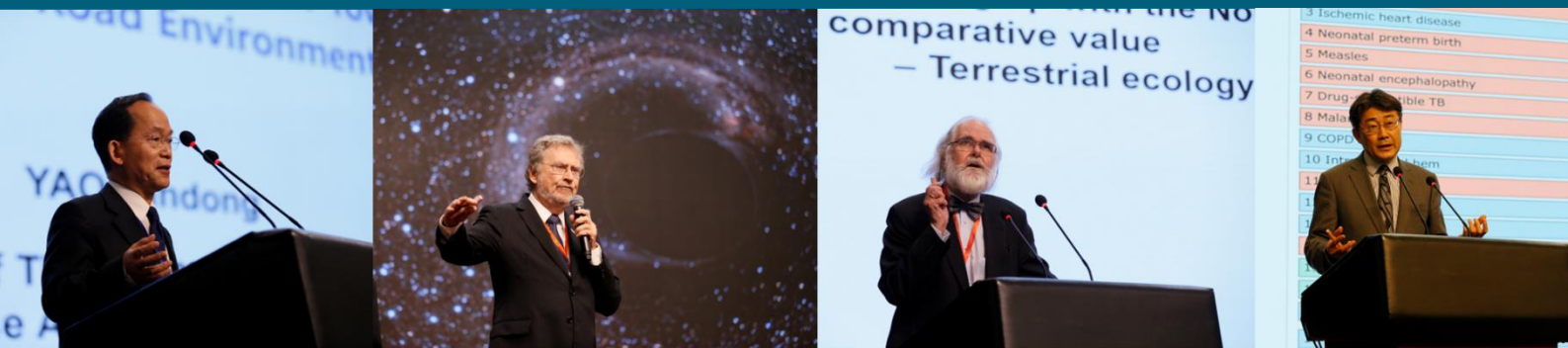
Photo Gallery of the First ANSO General Assembly